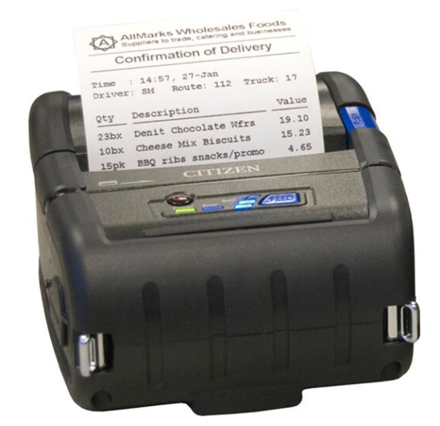
Prints up to 3 inches wide labels

To keep up to date with our products and news please visit <a href="https://www.citizen-systems.com/us">www.citizen-systems.com/us</a>