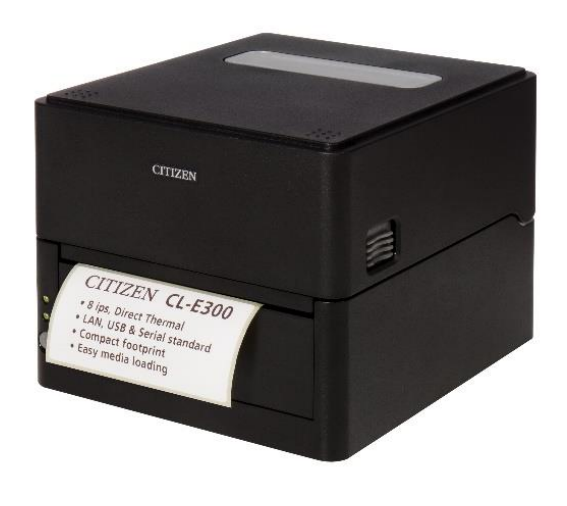
*Available in black or white casing

Citizen now offers certified Citizen wristbands for use in the CL-E300.